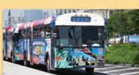
Free Midtown Shuttles