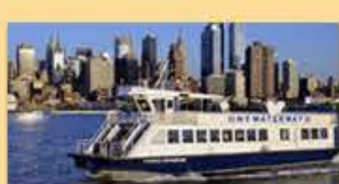
Fast, Frequent Ferries