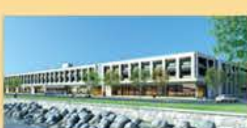
Two Parking Garages